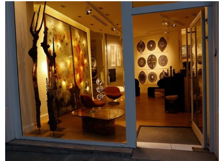
Symbiose – Paris 2017