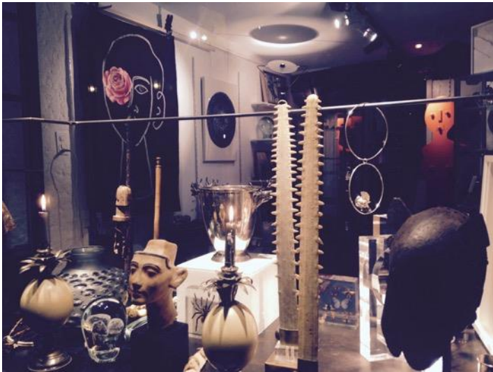
Confluences – Zurich 2016