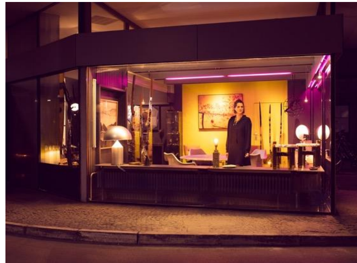
Genesis – Munich 2018 / 2019